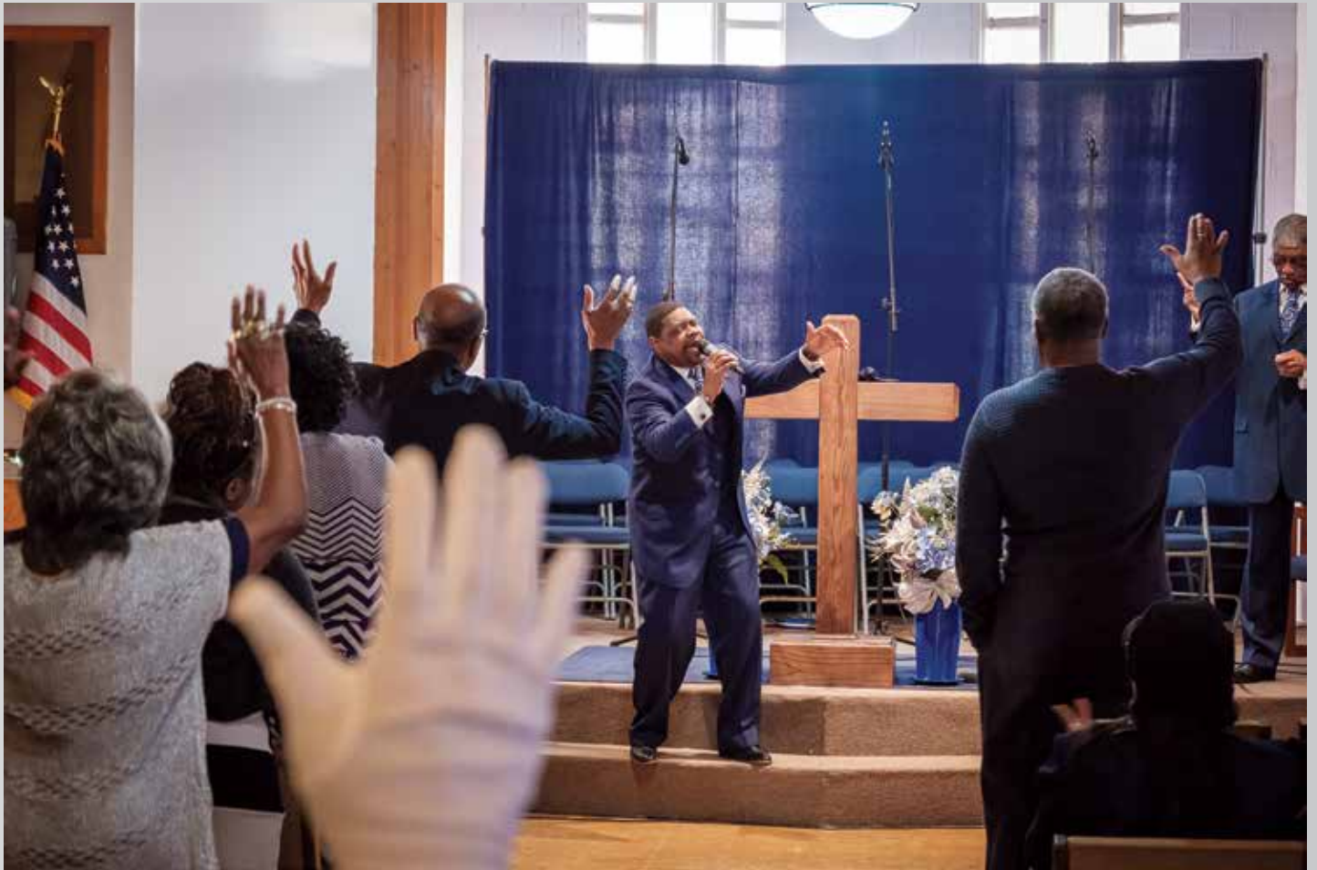
Divine Providence Baptist Church, Fort Wayne