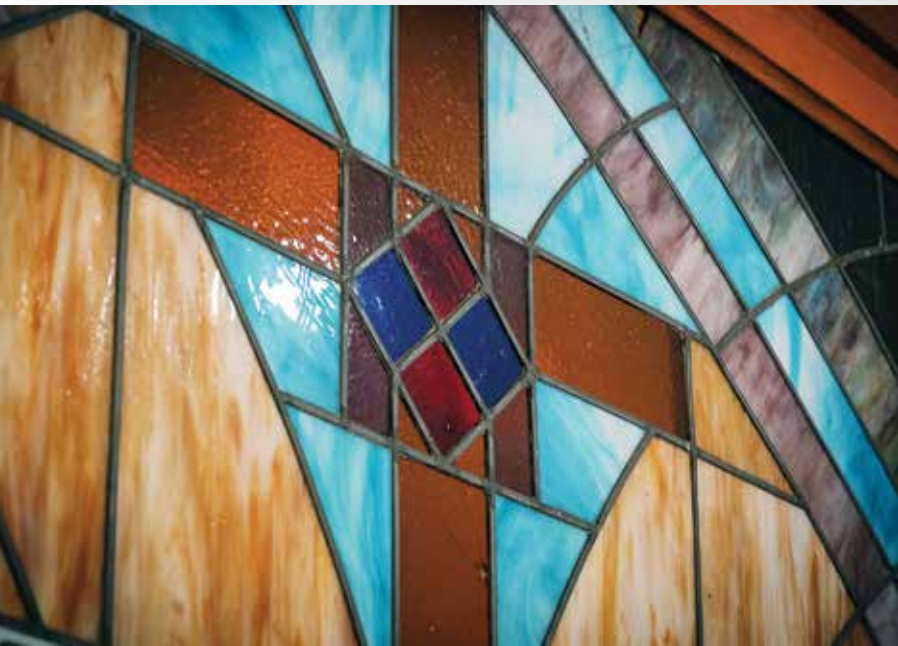
Trinity Christian Methodist Episcopal (CME) Church, Indianapolis