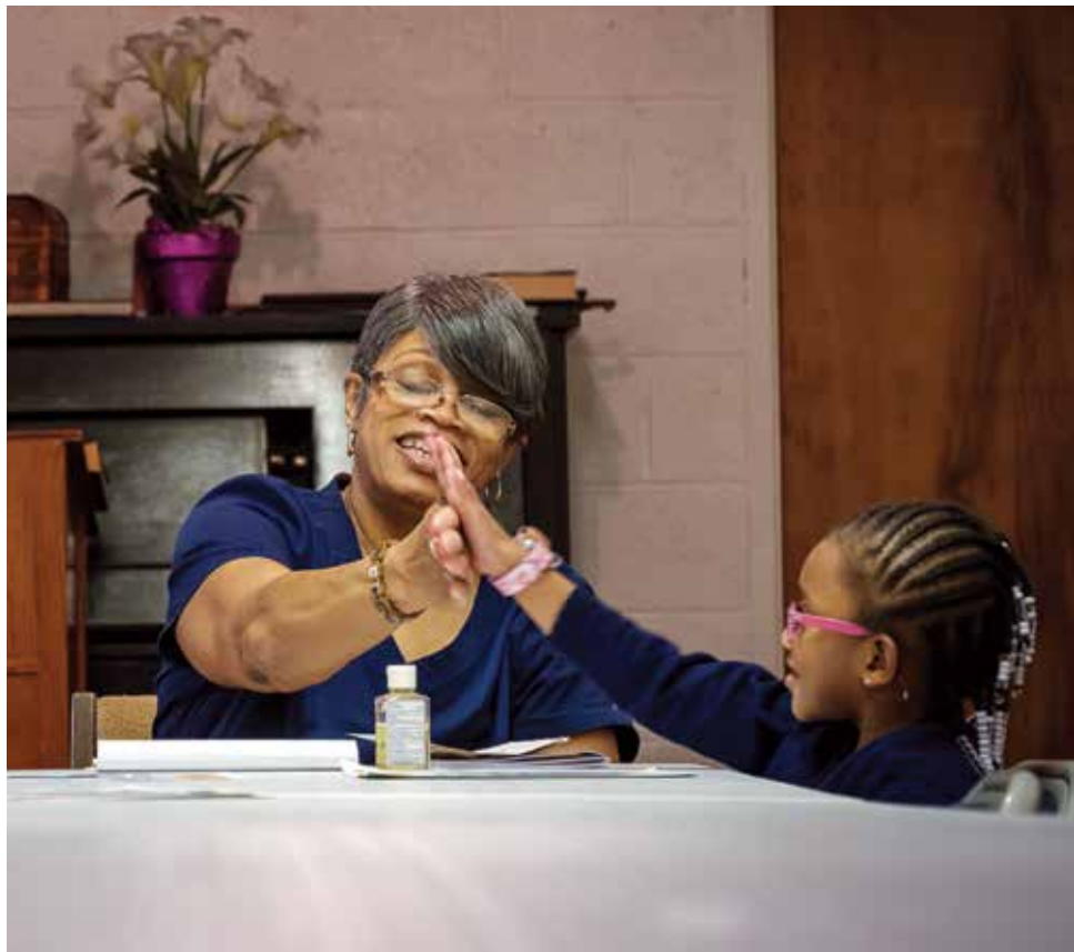
Divine Providence Baptist Church, Fort Wayne

Concrete benefits include increased attendance at prayer services. But the team also reports that members are embracing opportunities for ministry service, "willing to give it a try," understanding that God has supplied the local congregation with what's necessary to carry out its mission.