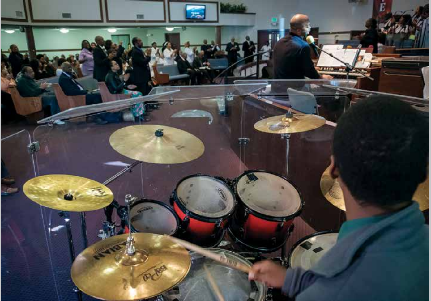
Trinity Christian Methodist Episcopal (CME) Church, Indianapolis