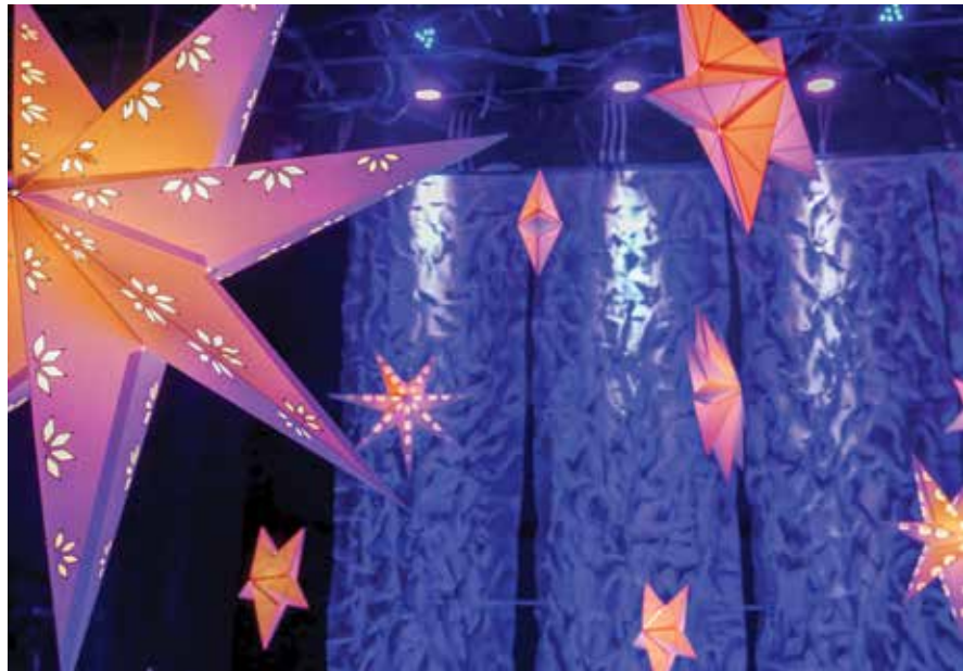
First Christian Church, Newburgh